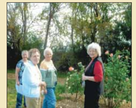
Members enjoyed the nice weather and roses at the Heritage Rose Garden near McKinney.

Reservations for all bus trips can be made beginning January 6 at 7:00 am. Our bus trips normally fill quickly, so please call on that day to reserve your space.