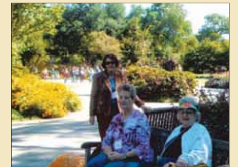
We were blessed with beautiful weather at the Dallas Arboretum.