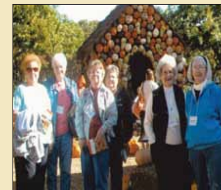
The Storybook Pumpkin Village was a favorite spot for many on the October bus trip.