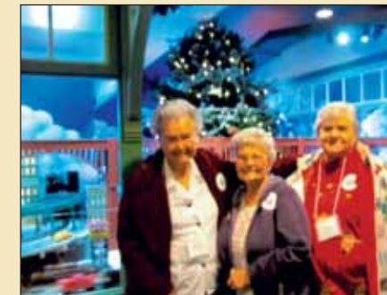
Members enjoying The Trains at North Park Center on the December bus trip.